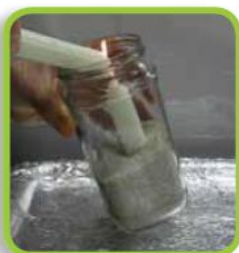
2. Light candle with another candle