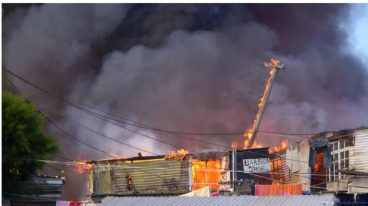
A fire in Imizamo Yethu showing the high density leading to destruction, possible deaths by the burning shacks with some spaghetti wires tapping electricity exploding and burning.