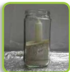
1. Place dry sand and candle in a jar