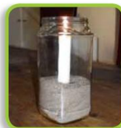
4. Place jar on a stable surface away from the edge