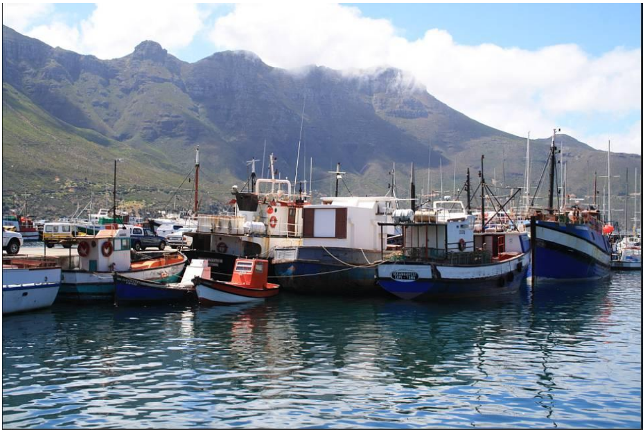
Hout Bay Harbour – what a gem – with proper management, planning, infrastructure and crime prevention it could unlock so many, many jobs and huge tourist potential