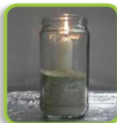
3. Candle flame should not burn higher than the jar