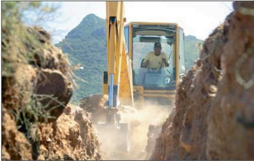
BACK TO NATURE: A backhoe removes rubble and fill at the start of major wetland rehabilitation in the Disa River floodplain at Hout Bay after legal action by the authorities against a development company.